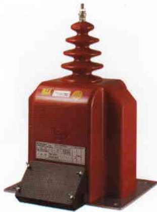
VT24 (0) 1B1S/2S